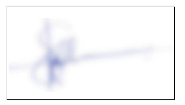
Name and signature of the Project Proponent

\boxtimes The Project Proponent declares that the information provided is correct and true